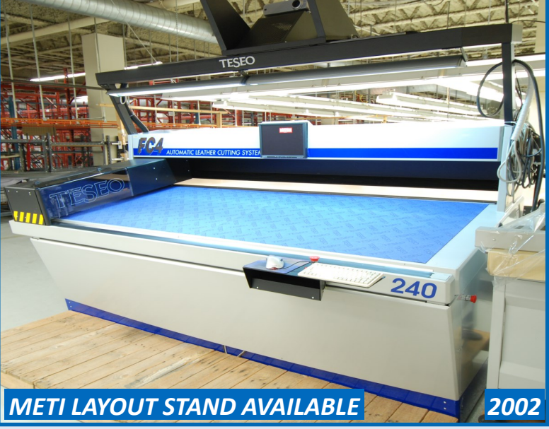
TESEO MODEL FC4 240 AUTOMATIC LEATHER CUTTING SYSTEM

Auction: Tuesday June 7, 10:30AM (ET) Inspection: Monday June 6, 9 AM to 4 PM