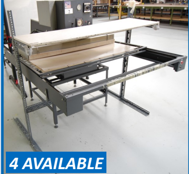
SIMPLEX FUSING MACHINE