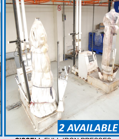
CISSELL FULL IRON PRESSES