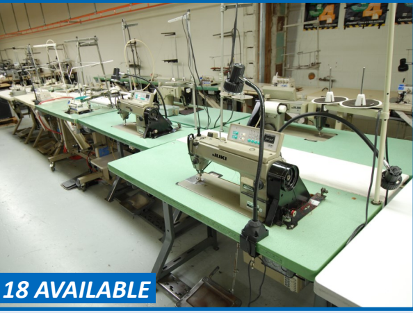
PARTIAL VIEW OF JUKI SEWING MACHINES

(65) Durkopp Adler model 767-FA-373 Sewing Machines w/ Quick Digital & Efka D/C Vario Control Readouts, most 110/1 Durkopp Adler model 745-34 White Single & Double Welt Sewing Machine w/ Flap Attachment, s/n 024675565, digital control