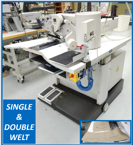
DURKOPP ADLER MODEL 745-34 SEWING MACHINE