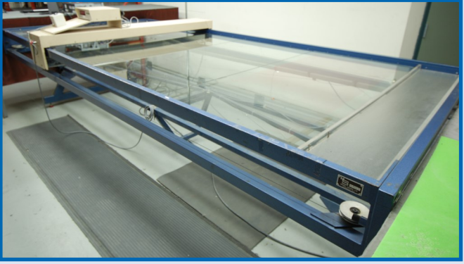
CENTIPLAN MODEL C1600X3200 MEASURING TABLE

2003 Giuliani Torino-Italy model IG/10MOD Leather Rub Fastness Tester, s/n 13748 GTI MiniMatcher model MM 4e Artificial Light Source