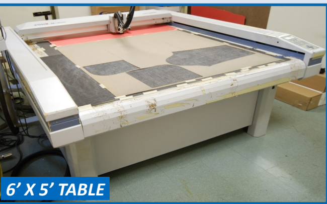
LECTRA SYSTEMS MODEL ZUND M-1600 CUTTING SYSTEM