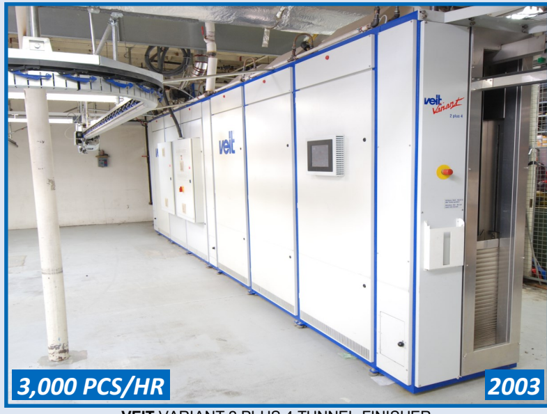
VEIT VARIANT 2 PLUS 4 TUNNEL FINISHER