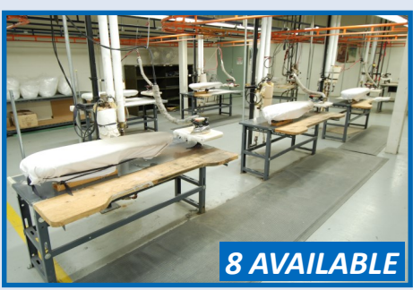
CISSELL IRONING STATIONS