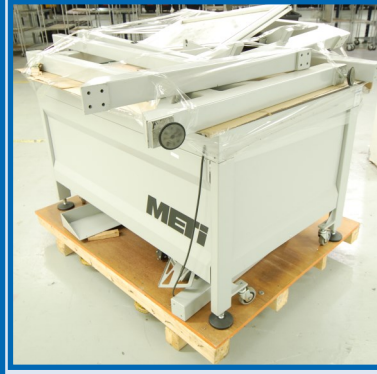
TESEO LEATHER LAYOUT STAND