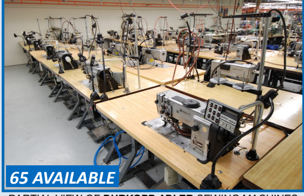
PARTIAL VIEW OF DURKOPP ADLER SEWING MACHINES