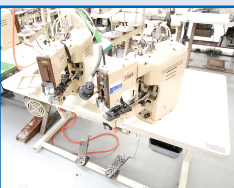
PFAFF BUTTON SEWING MACHINE