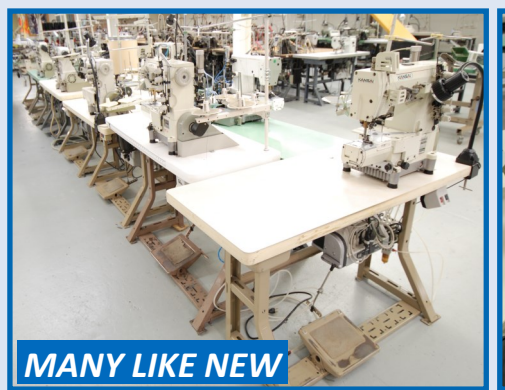
PARTIAL VIEW OF KANSAI SPECIAL SEWING MACHINES