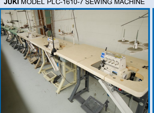
PARTIAL VIEW OF JUKI SERGERS