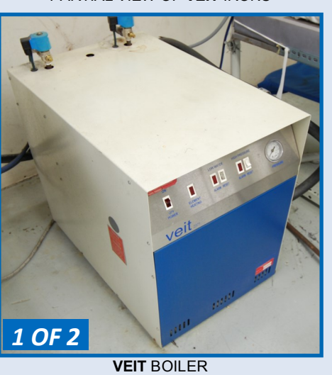
IRONING , FUSING & FINISHING

2003 Veit Variant 2 plus 4 Tunnel Finisher, 2 Steam Chambers, 4 Air Chambers, 77" x 10.5" Opening, 22'L Tunnel, 75' of Conveyor, 3,000 pcs/hr