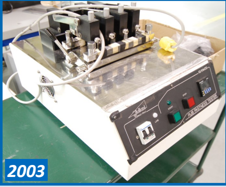
GIULIANI RUB FASTNESS TESTER