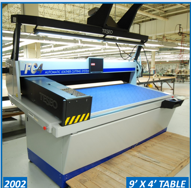
TESEO AUTOMATIC LEATHER CUTTING SYSTEM