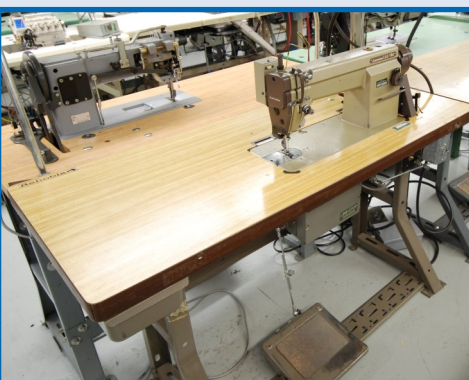
MITSUBISHI IVIZ SEWING MACHINE