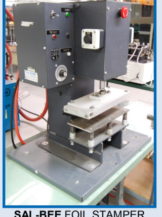
SAL-BEE FOIL STAMPER

Visit infinityassets.com to view Veit Tunnel Finisher in operation