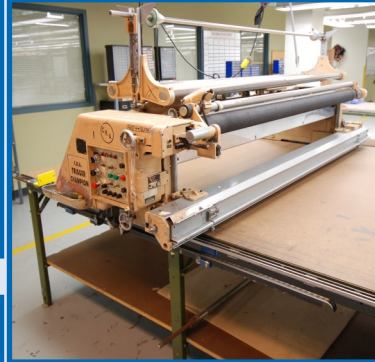
CRA CLOTH CUTTING MACHINE