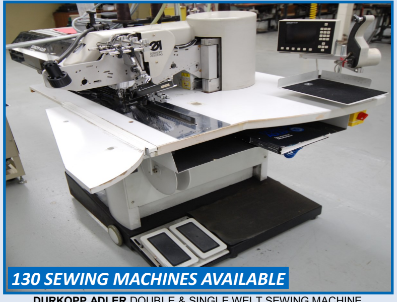
DURKOPP ADLER DOUBLE & SINGLE WELT SEWING MACHINE

2650 St. Clair Ave West & 53 Samor Rd, Toronto, Ontario