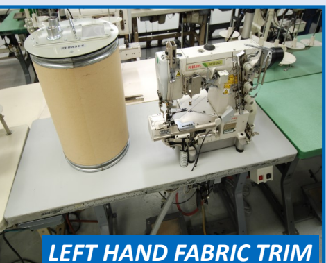
PEGASUS COVERSTITCH SEWING MACHINE