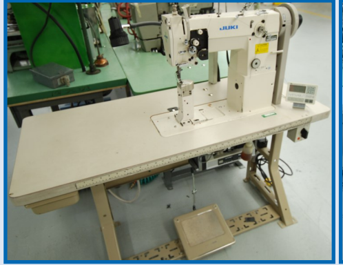
JUKI MODEL PLC-1610-7 SEWING MACHINE