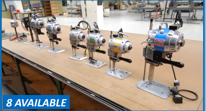
PARTIAL VIEW OF ELECTRIC CLOTH CUTTING MACHINES