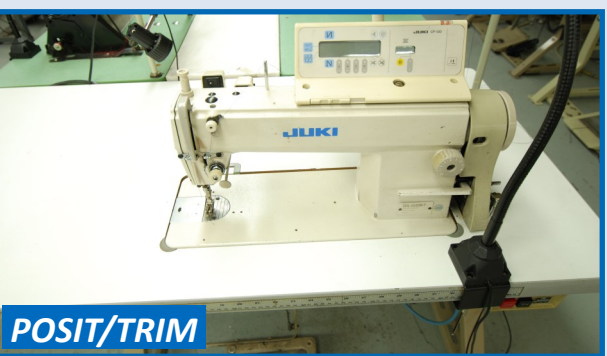
JUKI SINGLE NEEDLE LOCK STITCH SEWING MACHINE