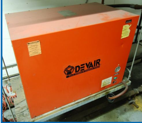
DEVILBLISS MODEL 8055 AIR DRYER

Note: 2 Locations, 1 Auction. All items to be sold at 2650 St. Clair Ave. West