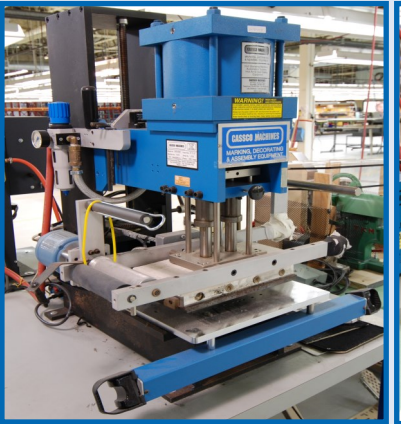
CASSCO MACHINES HEAT SEALER