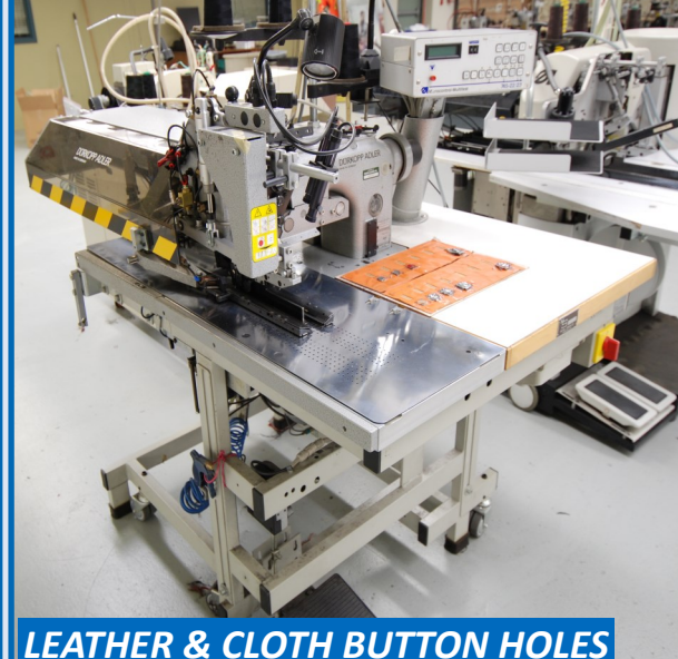
DURKOPP ADLER MODEL 745-22/23 SEWING MACHINE