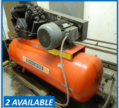
DEVILBLISS 15HP AIR COMPRESSOR