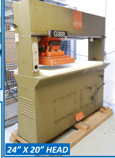
ATOM MODEL G888 25T TRAVELLING HEAD CLICKER PRESS