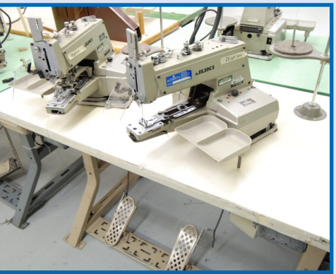
JUKI BUTTON SEWING MACHINE

Visit infinityassets.com to view complete specs & additional photos