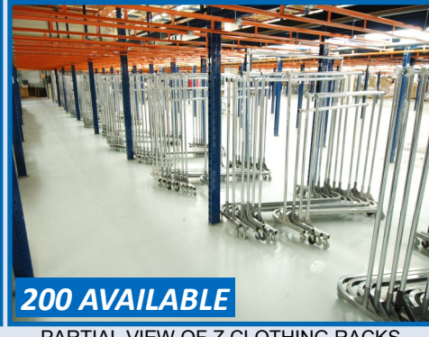
PARTIAL VIEW OF Z CLOTHING RACKS

Visit infinityassets.com to view complete specs