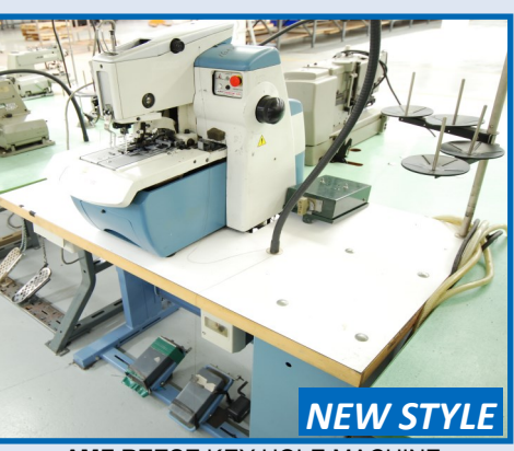
AMF REESE KEY HOLE MACHINE

(2) Pfaff model 3306/033/1 Button Sewing Machines Including Necking Style Unit, s/n's 855020, 852987