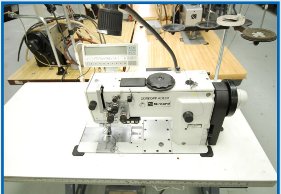
DURKOPP ADLER MODEL 767-FA-373 SEWING MACHINE