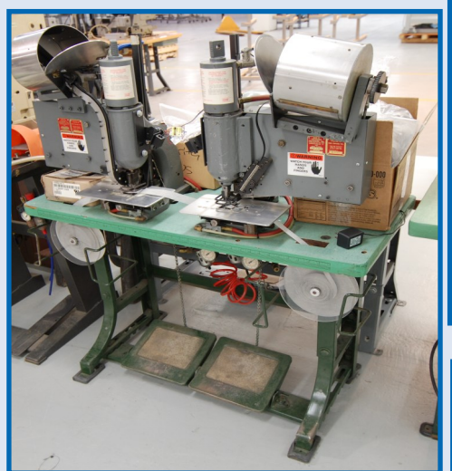
UNIVERSAL FASTENERS INC. HOOK & EYE MACHINE

Visit infinityassets.com to view complete specs & additional photos