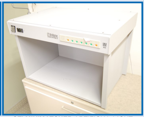
GTI MINIMATCHER ARTIFICIAL LIGHT