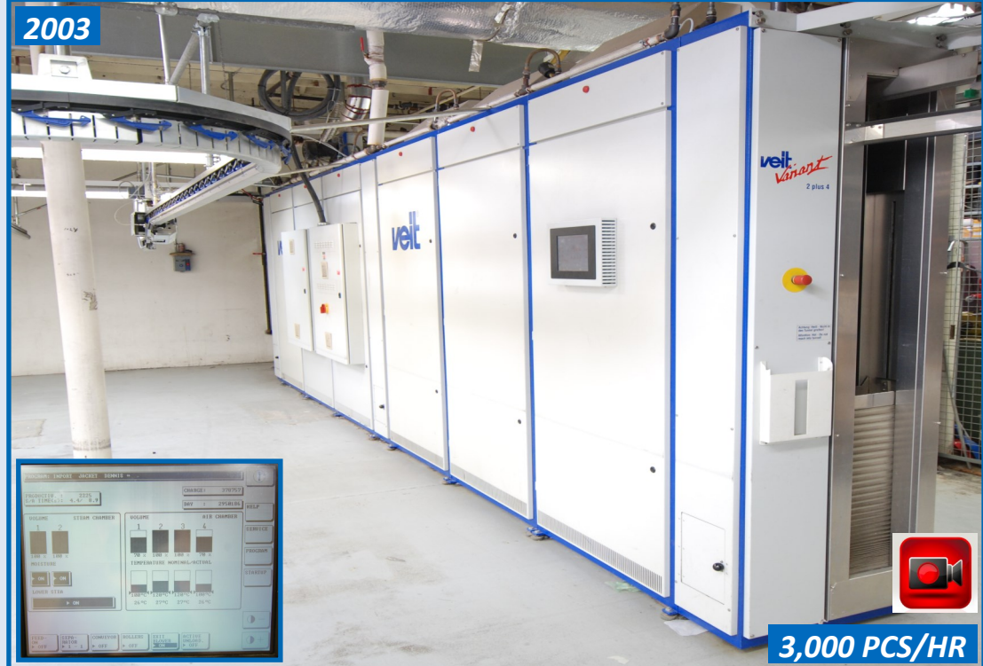
VEIT VARIANT 2 PLUS 4 TUNNEL FINISHER