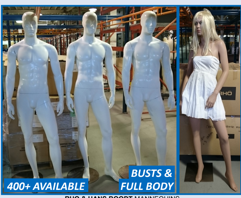
RHO & HANS BOODT MANNEQUINS